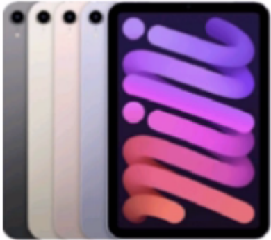
iPad mini (6th generation)