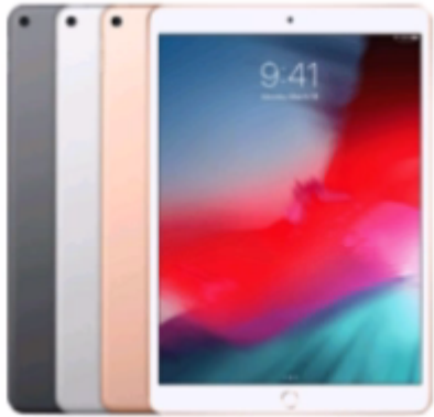
iPad Air (3rd generation)