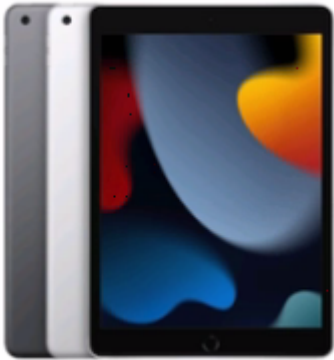
iPad (9th generation)