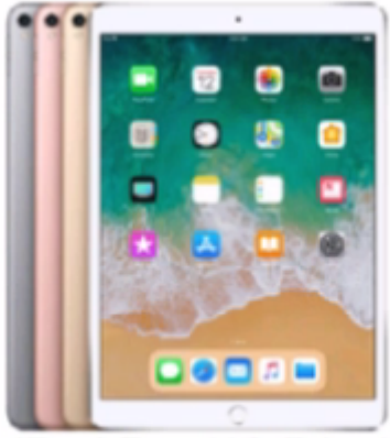
iPad Pro (10.5-inch)